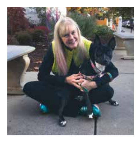
Jelly Bean with her new mom

including an anonymous donor who matched the first $5,000 raised, Jelly Bean was able to get her surgery. The generosity of FOAS' donors was apparently infectious—the veterinarian who performed the surgery also performed a pro bono surgery on Jelly's left leg. What could possibly be sweeter than this? Well, Jelly Bean found her forever home just in time for the holidays! Here she is, putting a big smile on her new mom's face.