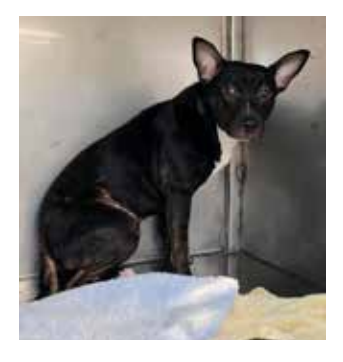
Jelly Bean at the shelter, too frightened to walk

Thanks to FOAS donors, we were able to end the excruciating pain and preserve the mobility of an adorable mutt, Jelly Bean. When she arrived at the shelter, Jelly Bean was so terrified and shut down that she had to be carried out of her kennel. The shelter's animal behaviorist, a FOAS-funded position, knew she would benefit by getting a break from the shelter. Through her efforts and FOAS's foster program, Jelly Bean was placed in a loving foster home where she instantly blossomed into a lovable, playful, energetic dog.