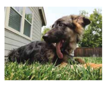
Qi'ra at home

In the face of overwhelming odds, three horribly abused puppies rescued after Memorial Day have made incredible recoveries—and they could not have done it without the generosity of FOAS donors. Chloe, Freya, and Frigg were found tortured and dumped—two with severely broken jaws, the third with a missing rear paw. Their veterinary