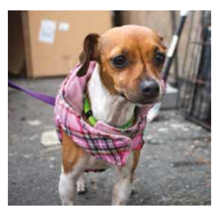
Dressed to impress for her spay appointment at a PetFix event!

Are you an Oakland resident who needs spay/neuter surgery for your dog or cat? Find out more at oaklandsanimals.org/ petfix