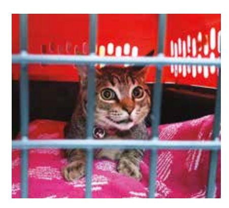
Minnie waits her turn for surgery at a September PetFix event

Through PetFix, Oakland residents can attend one of our monthly spay/neuter events in Oakland or take advantage of