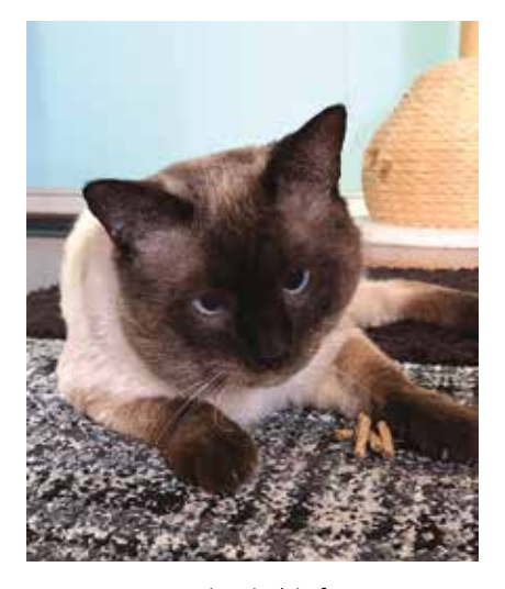
Percy recuperating in his foster home after surgery

Gun violence exacts a grim toll on our community, affecting all our residents-including animals. This spring. Oakland residents were shocked to learn that someone was shooting cats with a pellet gun within a two-mile radius of the Lower Dimond neighborhood. Oakland Animal Services rescued four severely injured cats in the span of a few weeks. The wounds appeared to be related and to have come from the same type of weapon. Unfortunately, one of the cats had to be euthanized because of the extent of his wounds, while another passed away while receiving treatment. The other two were stable but would require surgery.