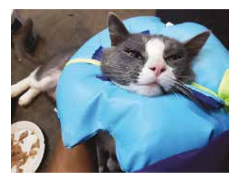
Migo back home, recuperating from surgery and looking for snuggles

Are you an Oakland resident who needs spay/neuter surgery for your dog or cat? Find out more at oaklandsanimals.org/petfix.