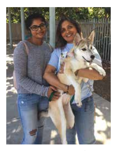
Nubbin and her adoptive family

As her foster family waited for Nubbin to grow old enough to be fitted for her prosthesis and go through rehab, they found themselves growing attached. They brought her back to OAS one more time to sign the adoption papers: Nubbin is home.