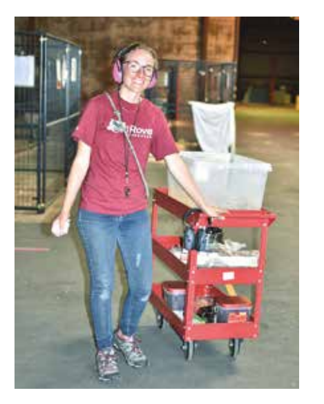
Bringing in supplies

Some shelters have the option of halting dog intakes until the virus is contained. But as Oakland's only open-door shelter, OAS continued to take in sick, neglected, and injured animals while navigating this outbreak. The quick actions of OAS and our partners, and funding provided by FOAS donors, ensured OAS was able to keep its doors open to incoming dogs while maintaining a high level of care for the dogs in quarantine.