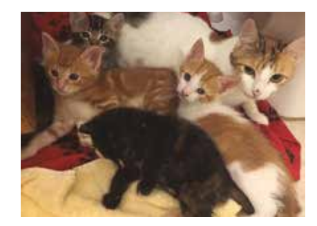
Mandarina and her litter of four

At Oakland Animal Services, any animal who comes through the door is welcome, regardless of his or her perceived adoptability. When a pregnant feral cat arrived she was no exception. And when she delivered her kittens, it was apparent that she and her new little family would need some special TLC and a quiet space outside of the shelter where they