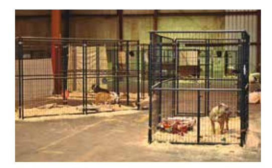
Kennels in the temporary off-site facility

Flu season is upon us now, but did you know that the flu can also wreak havoc in animal populations as well?