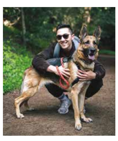
Coco on a hike with her foster dad

And for our animals, this new focus on foster care often means better, quicker adoption outcomes—a true silver lining in the pandemic crisis.